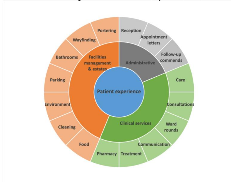
Figure 1: Patient experience category wheel.

Patient experience can be improved through many aspects. Adhikary et al. (2022) found that room cleanliness was the strongest factor to influence a patient's overall satisfaction in the hospital environment. A study by Le et al. (2020) found that reducing wait time using electronic sign-in and notification in the phlebotomy clinic helped to improve patient experience. Sodexo healthcare (2022) proposed that patient experience can be improved through three main aspects: 1) clinical services, 2) facilities management and estates, and 3) administration – with many sub-aspects within each – as shown in Figure 1. Given the complexities and variability in different clinical contexts, a simple patient experience survey cannot capture all the aspects that contribute to a patients' overall experience. By providing the tools and techniques to analyze huge datasets of patient feedback and outcomes, data science and artificial intelligence present an efficient way to understand patients' needs and feedback during the healthcare services (Sajid et al., 2021).